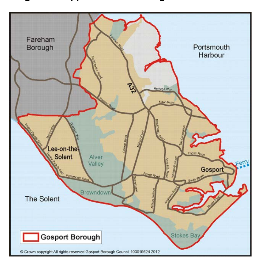
Figure 1 – Application of Parking Standards

1.1 This Supplementary Planning Document (SPD) sets out the parking standards for the administrative area as shown in Figure 1 below and is applicable to residential and non-residential developments and redevelopments of all scales.