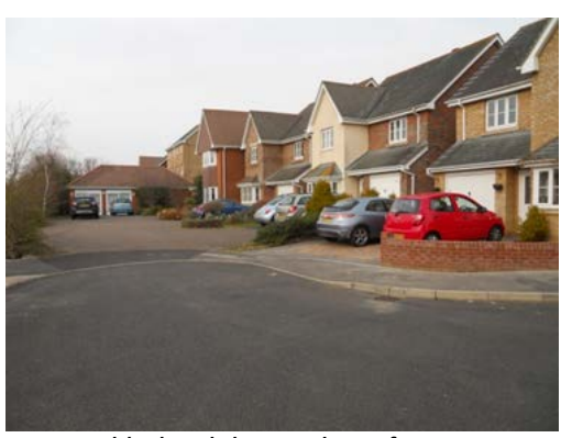
It is important to meet parking needs from the outset with the right number of spaces and through good design