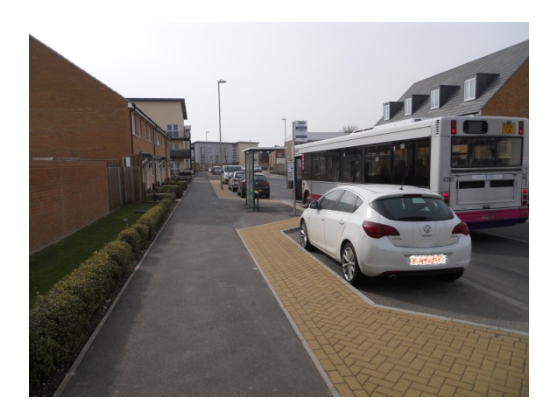
Parking at bus stops can be prevented through adequate parking provision, traffic regulation and good design of bus stops.