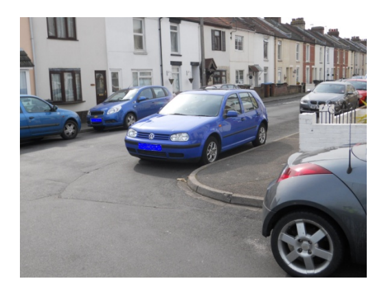
Many existing streets are full to capacity which results in inappropriate parking.