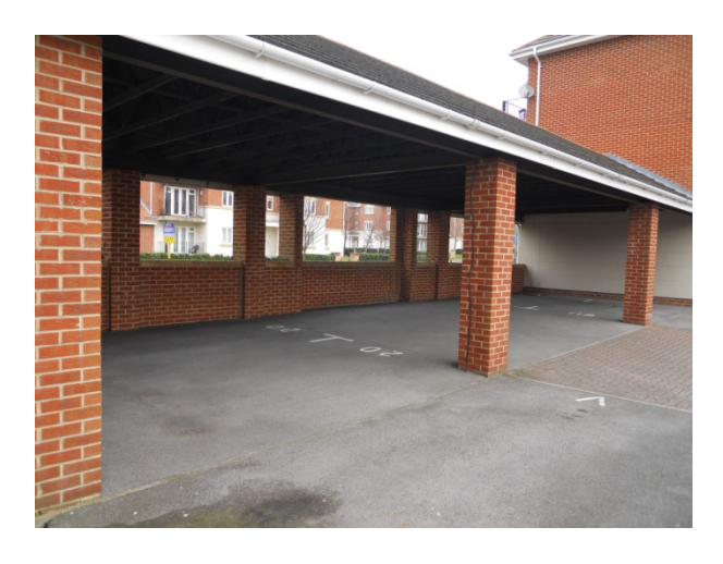
This area is marked out for 4 cars but can only be used for two.