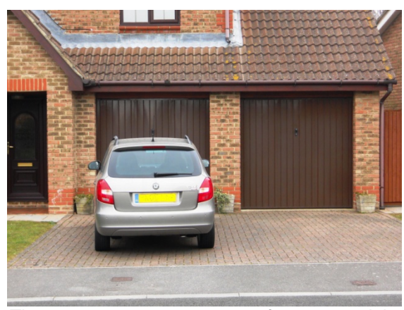
These garages are too narrow for a car and the driveway is too short to allow convenient access for cycle storage.