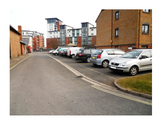
Parking spaces set back from the road.

4.18 Similarly parallel parking places should be wide enough to enable doors to be at least partially opened before encroaching on the carriageway.