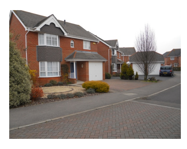
Two independently accessible off road spaces and a garage for storage meet most parking needs for up to 3 bed homes.

home, and often in a position perceived to be secure. Allocated parking is the most practical and marketable arrangement for most low density development. However, due to limitations on available space and the desire for cost efficiency, it may not be practical to provide for the maximum parking need of every individual unit of development over time, and a small degree of parking overspill onto the street may be acceptable where there is spare capacity.