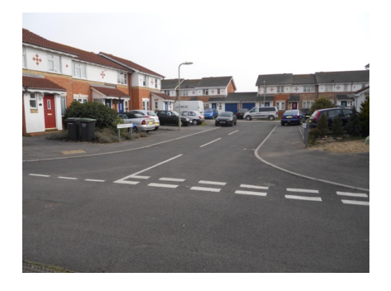
Damage to verges and obstruction of footways is a common problem