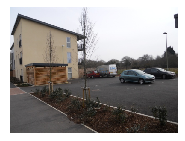
Unallocated shared parking and shared cycle store

3.9 Where a mix of allocated and unallocated parking is proposed it is necessary to ensure that the second and third cars of households do not prevent the parking of the only cars of other households. Where there is a mix of allocated and unallocated parking all homes should have at least one allocated space and all users must also be able to park in locations convenient to their homes.