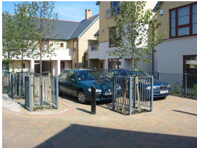
The result of a missing bollard or poor design? (designs have to eliminate poor parking habits)