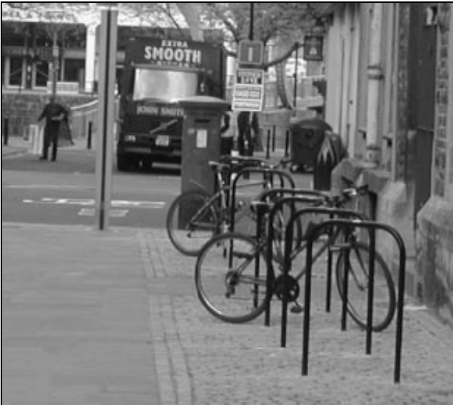
Example of Sheffield type stands